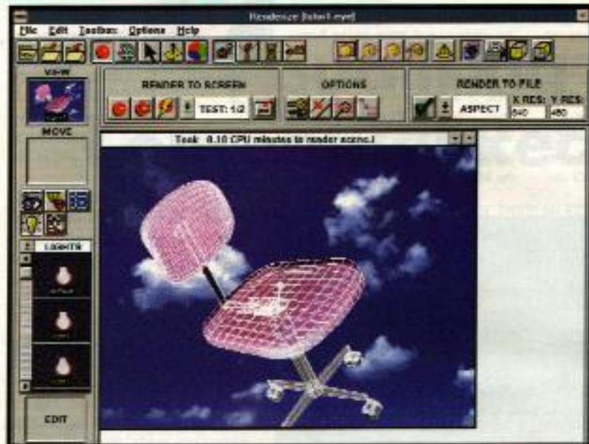
Users can construct a wireframe of a 3D object with animated viewing capabilities.

text on multiple lines with left, center or right justification. It also allows the definition of a horizontal or vertical offset for the extrusion path, beveling of extruded edges, and the previewing of extruded text strings as 3D solids. Extruded fonts can be saved in 3D models in the DXF file format.